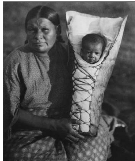
“A Comanche Mother” by Edward S. Curtis. Volume 19, plate 685, 1927.

The Libraries joined with the Honors Film Studies Association (HFSA) and the University of Arkansas Native American Symposium for a student-led project and exhibit in the late fall. Students from the HFSA selected twenty images from Edward S. Curtis’s The North American Indian housed in the rare books collection in Special Collections. The Libraries then digitized and reproduced those images for an exhibit in November in celebration of American Indian Heritage Month. The Symposium held its opening ceremony in Mullins Library on November 6 that concluded with a tour of the art exhibit and the Special Collections Department, including a peek at the Curtis volumes and portfolios.