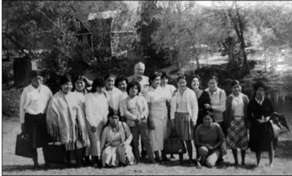
Andean Peace Mission from Cochabamba, Bolivia, at War Eagle Mill in 1985. MC 1532, Box 9, Folder 1.

The Special Collections Department recently opened the papers of the Arkansas Chapter of the Partners of the Americas (POA), a private sector volunteer organization that promotes economic and social development throughout the Western Hemisphere. POA-Arkansas generously donated these papers covering its activities from 1973 to 2002, along with funds to pay for their processing.