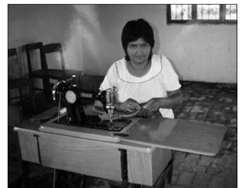
A Bolivian woman takes sewing lessons on a machine purchased through the Partners of the Americas. MC 1532, Box 9, Folder 6.