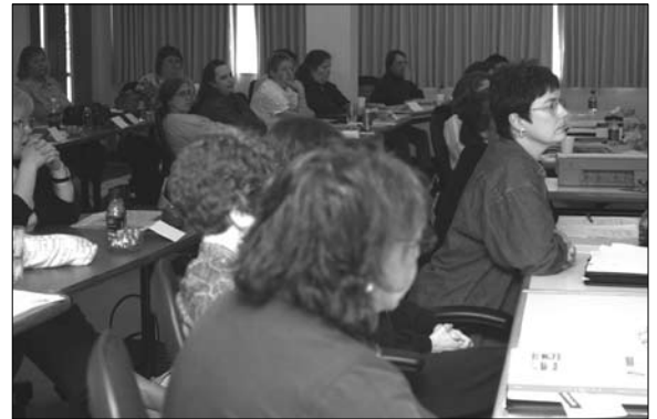
Libraries' personnel listen to a presentation at the Strategic Goals Planning Retreat at Petit Jean, Arkansas.

the main library building, to develop an assessment plan for collections and services, to design a cohesive instructional plan, to create a marketing plan, to increase the Libraries' endowment, and to develop an employee recruitment and retention plan.