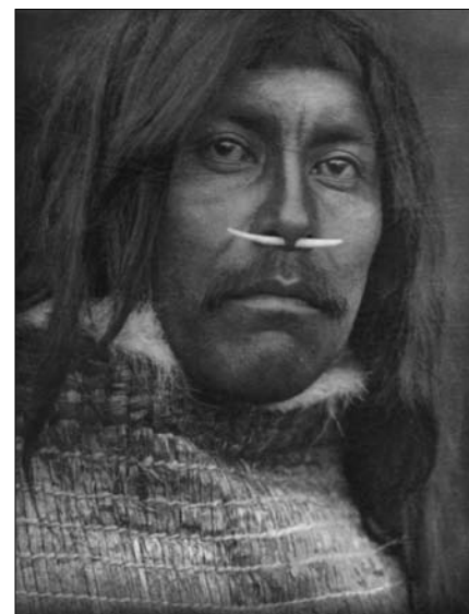
“Qa’hila – Koprino” by Edward S. Curtis. Volume 10, plate 331, 1914.