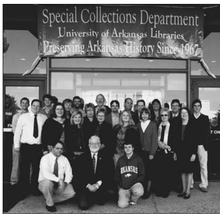
A group photo of the Special Collections Department.