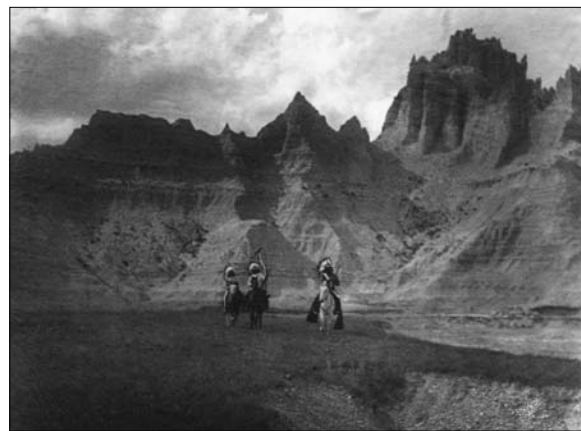
“Into the Badlands” by Edward S. Curtis. Volume 3, Plate 119, 1904.