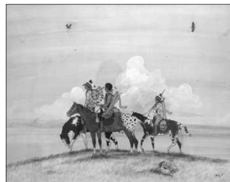
“Enemy Country” by Beatin Yazz, a WWII Navajo code talker. From the Ashworth Collection.

pencil sketches, bronzes, and pottery depicting the Native American history and lifestyle. Ashworth says, “I like older pieces of art that were painted on site or seen as history actually took place,” but he also appreciates contemporary art.