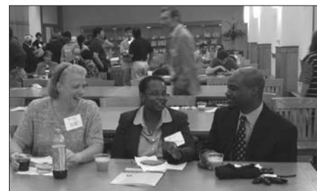
Members of the faculty honored at the reception attended with their families.

ation of a scholarly book that was crucial to their research, one that inspired or encouraged them as readers, to a book read in childhood that brought back distant memories. An exhibit of those books and the faculty comments were displayed in the Walton Reading Room.